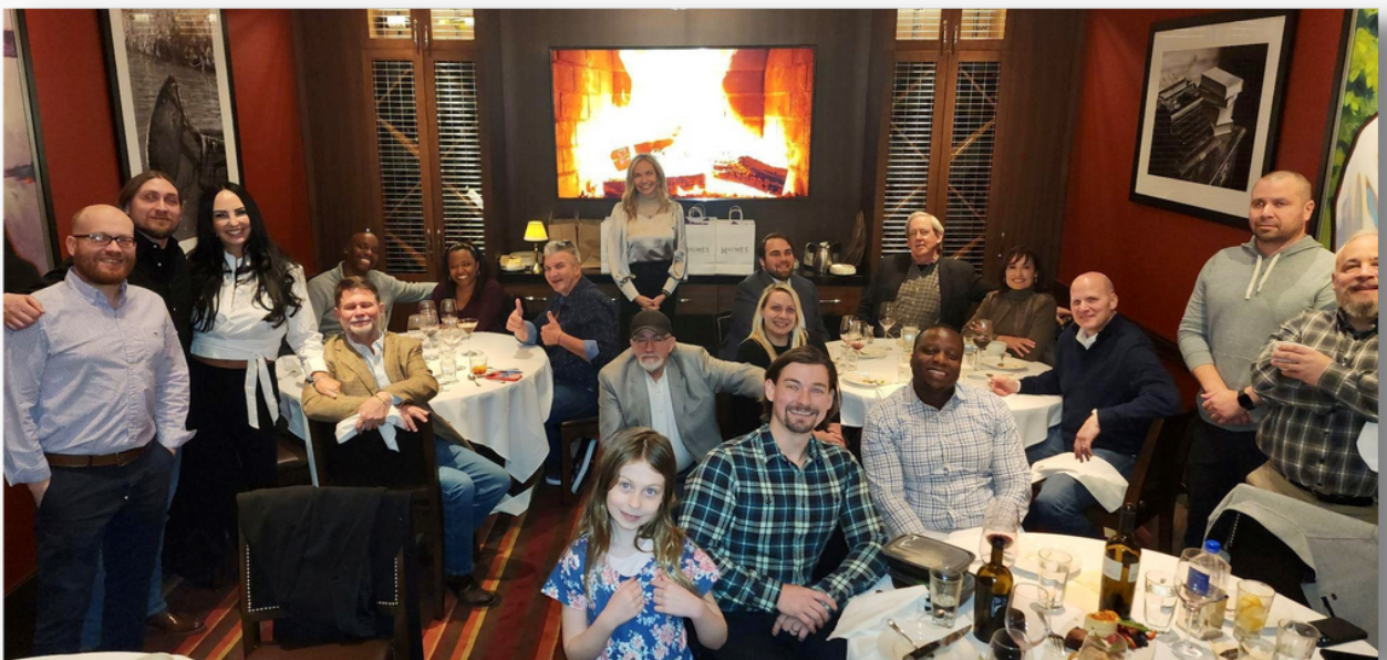
Himes Post Holiday Party