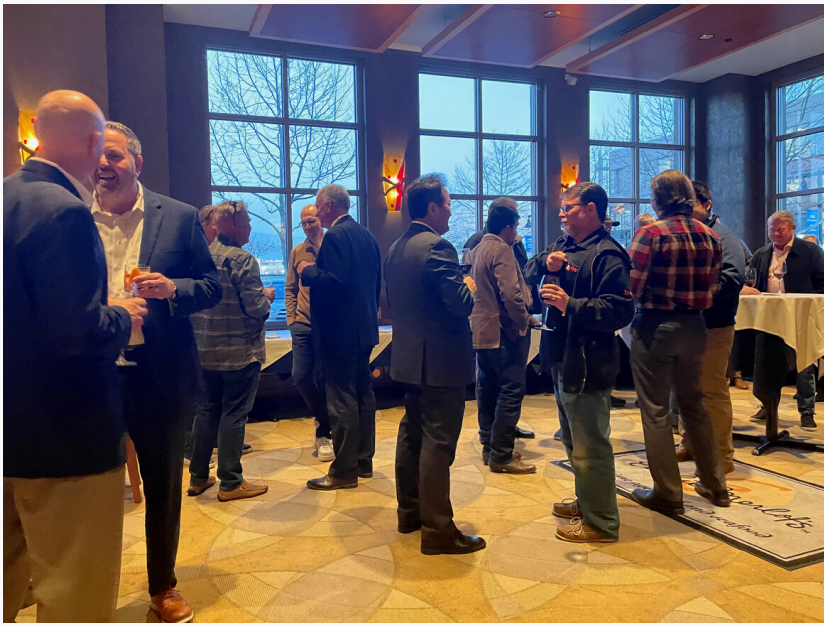
Himes Mission Critical Power Hour

The Himes Team worked hard and played hard this quarter. From our Post-Holiday Team Party at Capital Grille, to our Himes Mission Critical Power Hour, to networking events like DC ConnX, BisNow, and CoreNet, Team GSD was active in the community. We also focused on volunteering opportunities in the DMV. We look forward to a busy Q2 with more social and networking events!