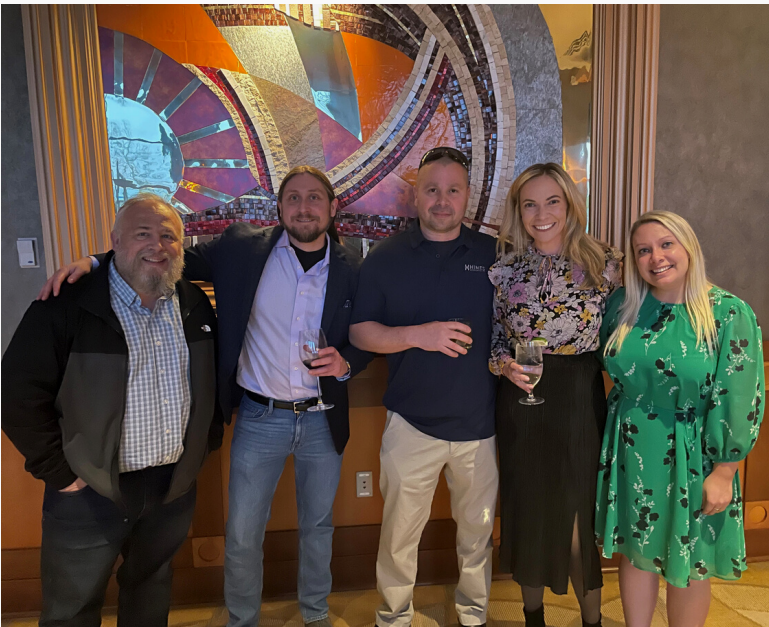
Himes Mission Critical Power Hour