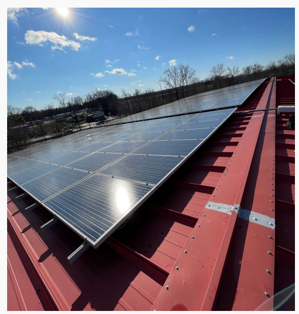
White Marsh decommissioned solar panels

This is a Himes managed design-build project. There is an existing solar training center to be decommissioned since this is an old system from 2013 that was inherited upon buying this center. Himes' involvement includes overseeing and designing the new solar system, procurement, and installation (burners, racking, electrical gear).