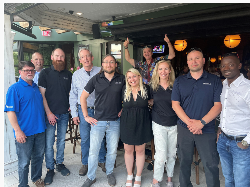
Mission Critical Team Happy Hour