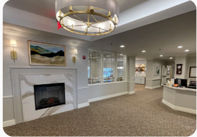
Renovated Reception Desk and Entrance

Himes Associates, Ltd. managed the renovation of Sunrise Senior Living's Brighton Gardens of Wheaton, Ohio, focusing on interior remodeling of key common areas. This included the Entrance Lobby, Reception Desk, corridors, public and private Dining Room, Activity Room, Living Room, Salon, new Bistro Bar. The Memory Care areas, staff offices, and public restrooms were also upgraded. The project was carried out while the facility was occupied, ensuring minimal disruption to residents.