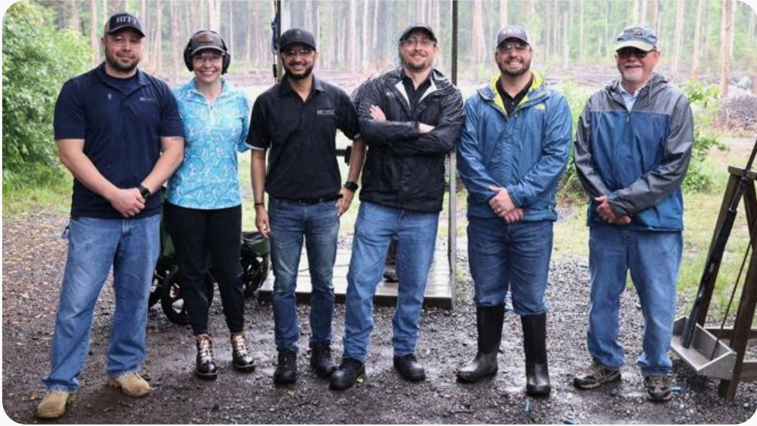
Team Himes at the DC ConnX Clay Shooting Tournament