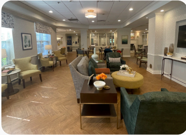
Renovated Living Room Area