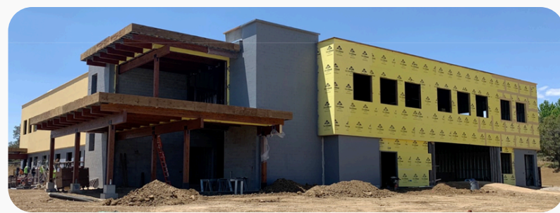
Exterior of the Medical Office Building