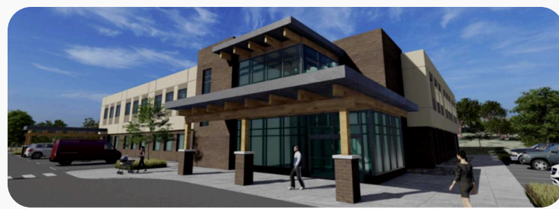
Exterior of the Medical Office Building - Rendering

Himes serves as the financial partner for the construction of a Medical Office Building adjacent to Mercy Hospital in Durango, CO. This project involves developing a 36,648 GSF, two-story medical office building on an elevated site near the Mercy Hospital campus. The project also includes parking and site improvements to support the new facility. United Surgical Partners, Inc. (USPI) will lease approximately 14,644 SF on the first floor for an ambulatory surgery center, while Catholic Health Initiatives will lease the remaining 18,646 RSF for various medical support operations. The project schedule is as follows: the core and shell construction began in November 2023 and is on track for completion in September 2024, with tenant improvement and occupancy expected by March 2025.